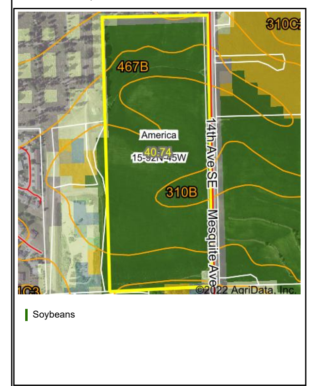
America 15-92N-45W 310B Mesquite Ave 02022