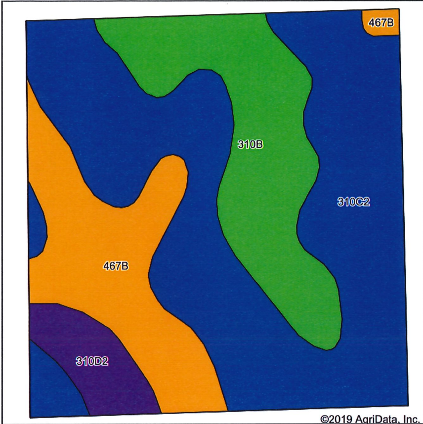
Soils data provided by USDA and NRCS.